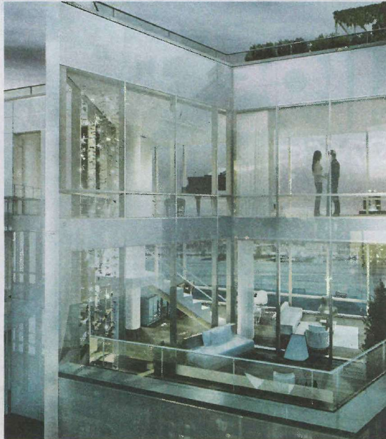
The apartments vary from one bedrooms starting at $950,000 up to more than $6 million for a penthouse unit (pictured).